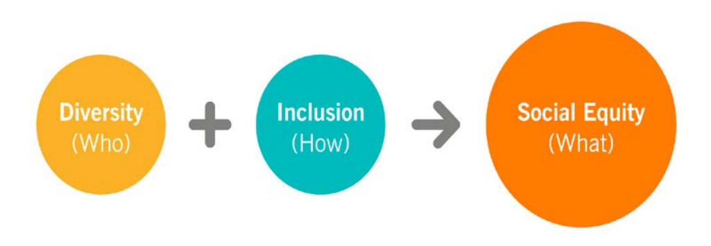
Figures Above From "Building the Bridge for Diversity and Inclusion: Testing a Regional Strategy;" The Foundation Review 2:2 (2010)

The Wege Foundation believes diversity encompasses, but is not limited to, ethnicity, race, color, age, gender, gender identity, sexual orientation, marital status, veteran status, immigration status, economic circumstances, physical and mental abilities and characteristics, faith tradition and philosophy (see, e.g. figure above; referred to below as "diversity characteristics"). The Foundation respects and celebrates all forms of diversity that contribute to a healthy, caring and thriving community. To this end, the Wege Foundation is committed to changing in order to become a more welcoming partner to groups with diverse cultures, philosophies, worldviews and experiences. The Foundation understands diversity, equity and inclusion to be interrelated as illustrated below: